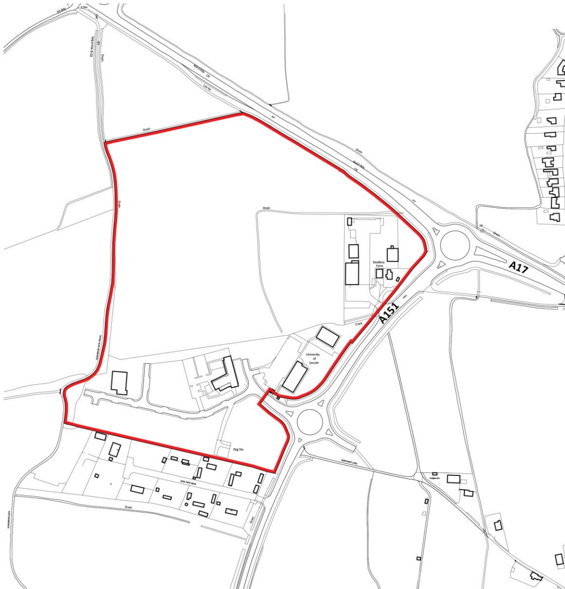
Figure 1 Location Plan