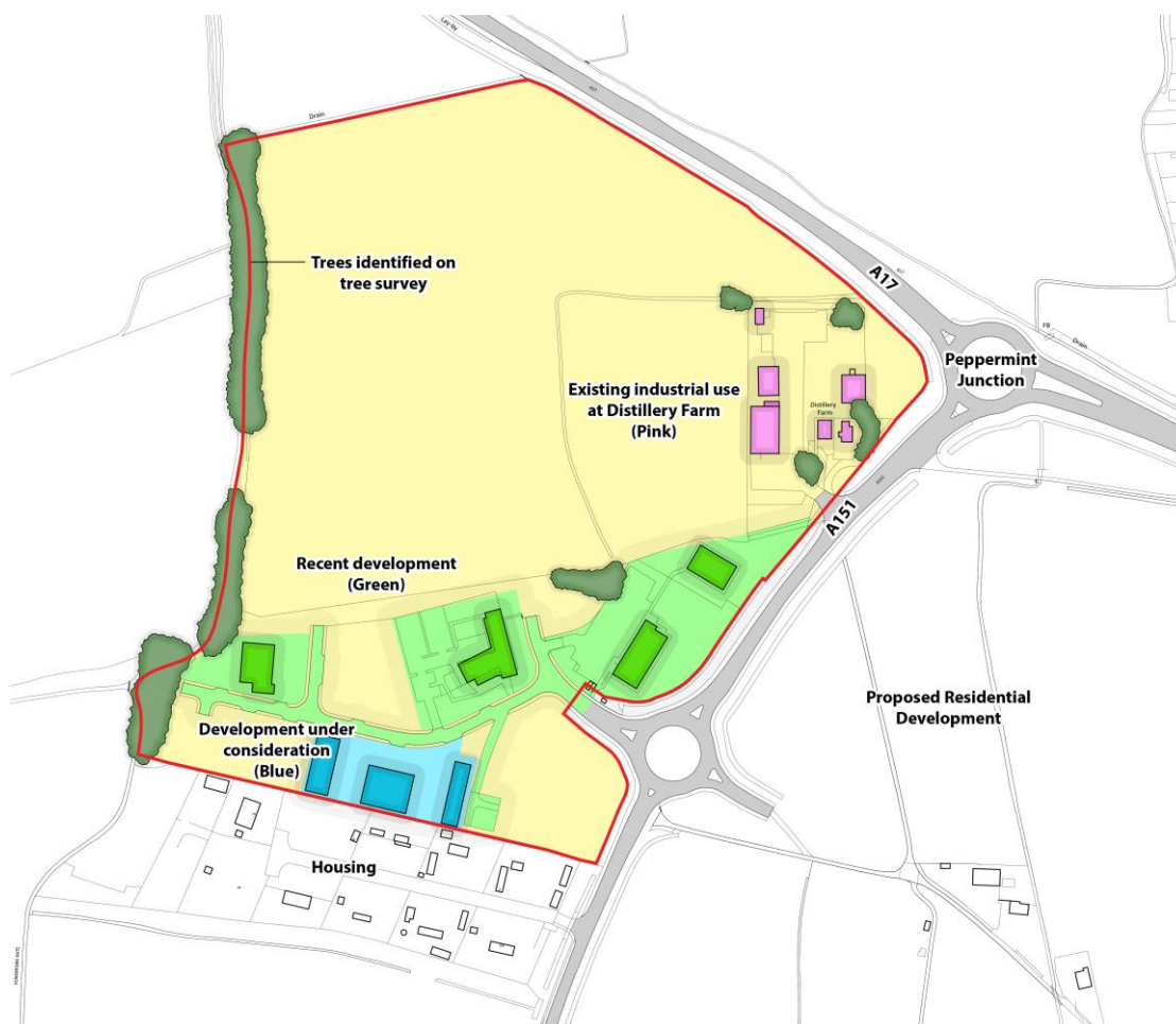
Figure 4 Constraints Plan

within the SLFEZ or to another appropriate site. The rest of the site is in agricultural use, characterised by fields, dykes, hedge lines and a small stand of trees set back from the A151 boundary.