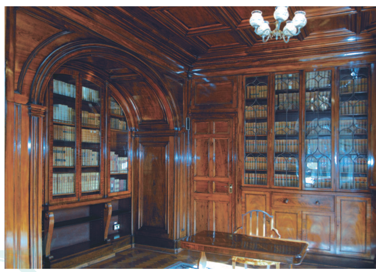
The 19th Century Library

The adjacent 19th Century Library provides a fantastic setting for photographs and signing the Register, and is also licensed for ceremonies, with a maximum capacity of six people.