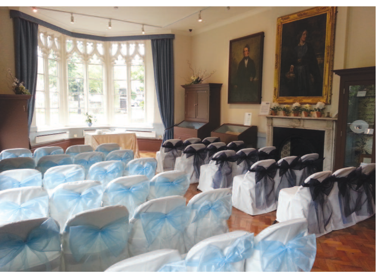
The Spalding Gentlemen's Society room