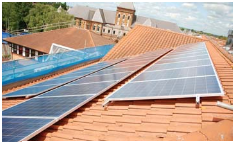
Solar panels on the roof of the SHDC offices at Priory Road.