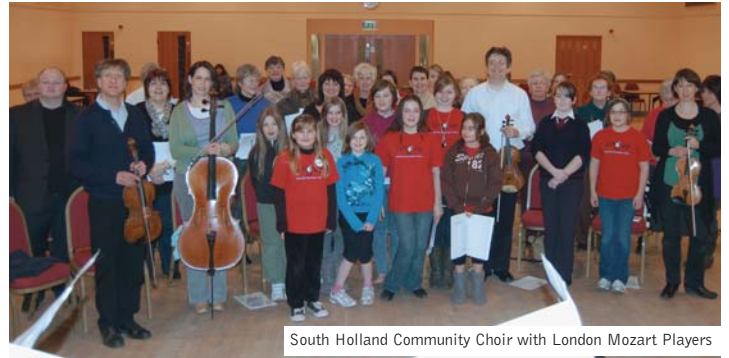
South Holland Community Choir with London Mozart Players

The choir's first performance was a link-up with the London