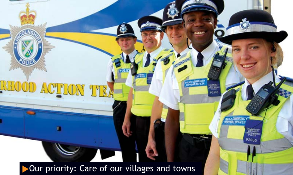
► Our priority: Care of our villages and towns