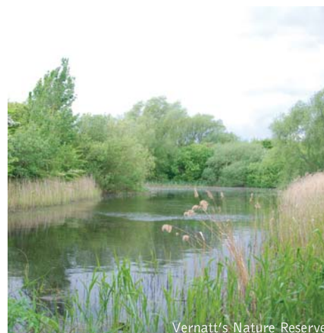
Vernatt's Nature Reserve

Another key element of sea defences is to protect our Grade I agricultural land, important to us and to the whole country in terms of the food produced here.