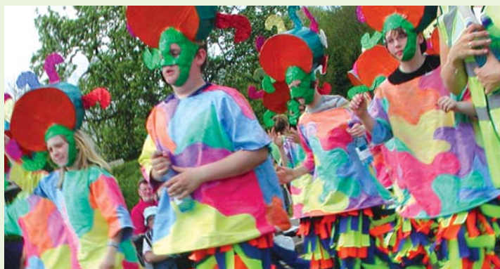
Spalding Flower Parade Saturday 5 May 2007

The search is on for aspiring actors, singers and dancers for