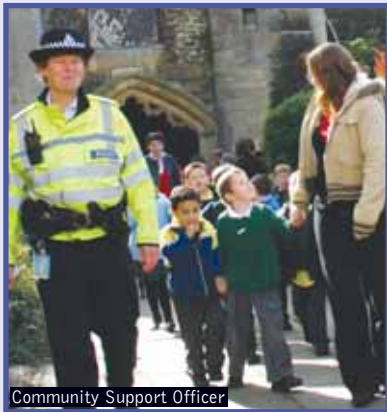
Community Support Officer