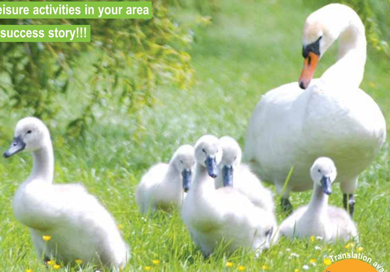
Swans in Crowland